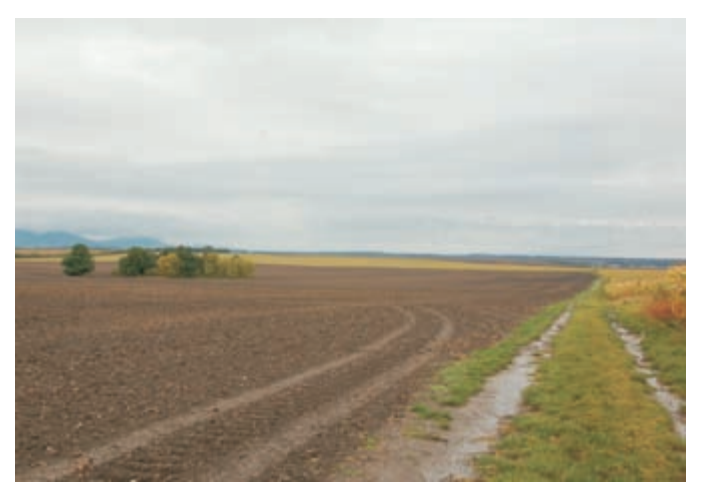
We akcknowledge the need to restore the missing system of ecological stability

Upon submitting the updated project we agreed on a close cooperation in the course of preparing a report on forest management in LVCL as part of the updated LVCL Management Plan. We agreed on other topics which will be subject to joint collaboration of our BR with the Židlochovice Forest Enterprise, among them the issues of the mpact of the European beaver, zonation of the Lower Morava BR and others.