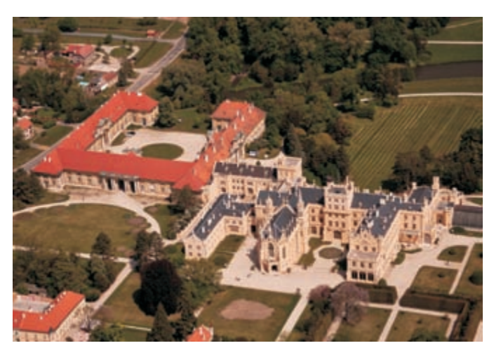
Chateaux Lednice and the complex of its former riding hall

Our present activities within the project are defined by the Agreement on Partnership and Mutual Cooperation closed in 2009.