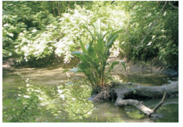
Dyje River Flooplain Special Area of Conservation

In 1994–2000, the hydrological relations in an important forest complex "Kančí obora" were improved under a major floodplain forest restoration programme. However, several parts of the project in the vicinity of the town of Břeclav were not completed according to the original plan. Due to the proposed changes of the given forest into a different