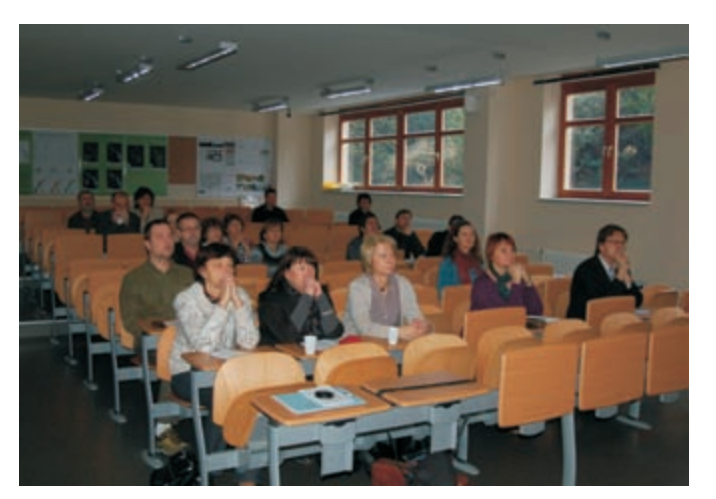
Workshop on Cultural Landscape Management