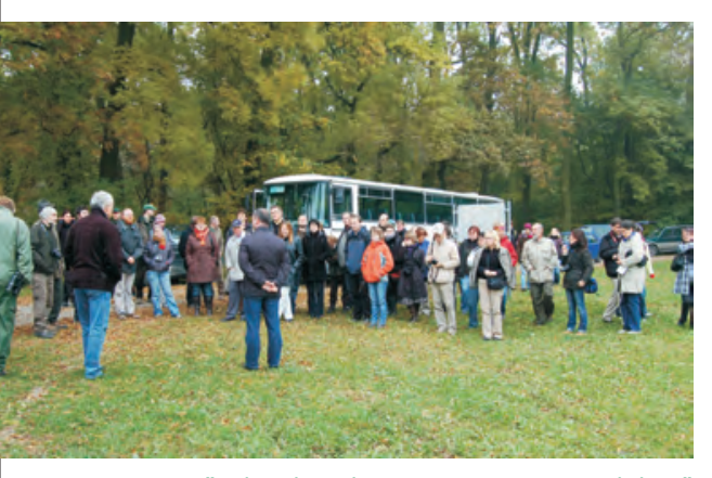
"Cultural Landscape Management Workshop"

The issues of cultural landscape protection, management and use have been closely linked to the emergence of civil society in the Czech Republic. Its solution requires an up-to-date objective analysis of the present state of affairs and